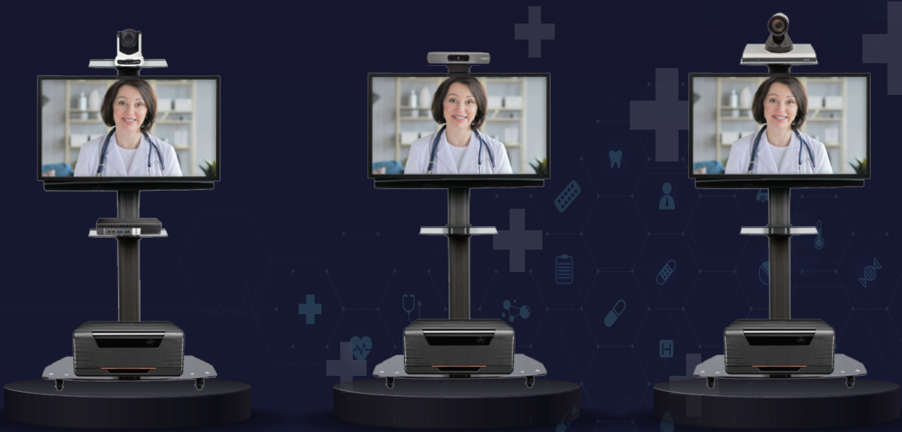
ICU Cart 1

PeopleLink ICU Cart for Operation Theaters, Intensive Care Units, Newborn Baby Wards, Covid Wards, Reception, etc.